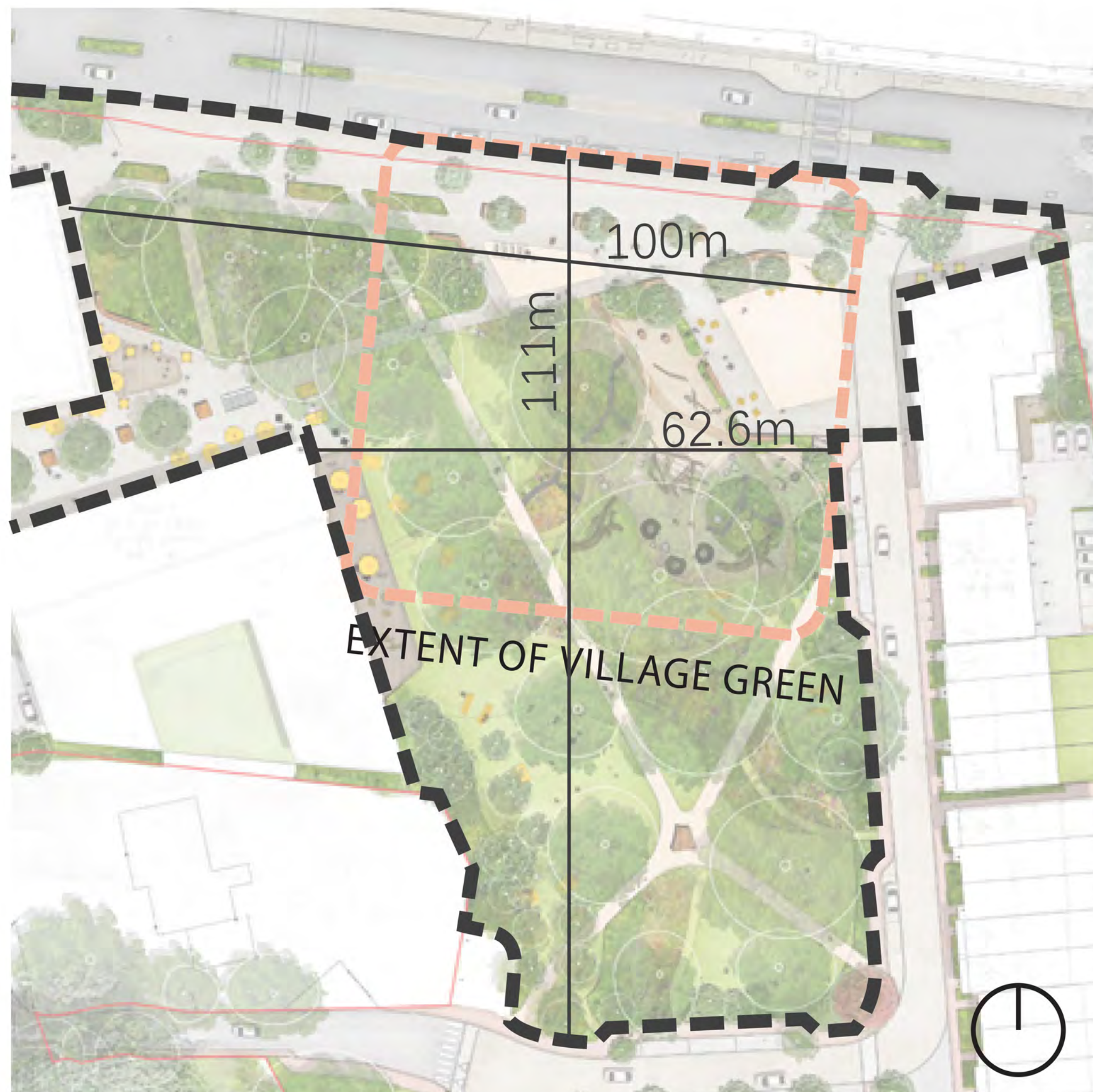
Extension to Ascot High Street Plan / Proposed Site