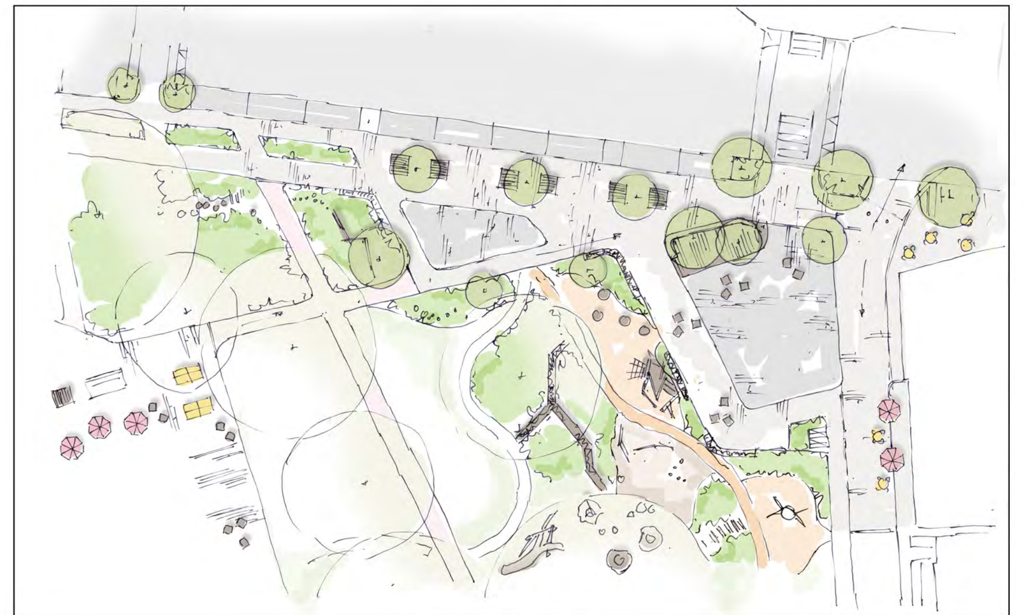
Day to Day